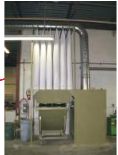
MKA Dust Collector

This open bag unit is perfect for small shops that require a high quality dust collector. Also effective as an addition to an existing system. Flexible to meet most regulations allowing the unit to sit inside the building. Available in a wide variety of filter diameters, and options for drums, or self-dumping hopper bin.